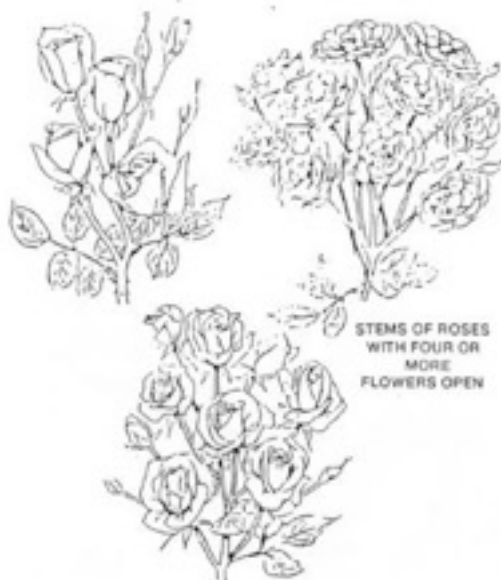
STEMS OF ROSES WITH FOUR OR MORE FLOWERS OPEN

Stems shall have evenly spaced and gracefully arranged flowers with or without sidebuds, forming an attractive flowerhead symmetrically arranged around the main stem. The type of flower shall not be taken into consideration.