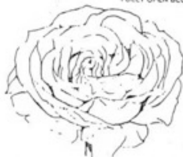
FULLY OPEN BLOOM

The first requirement in form is that the bloom must be past the three-quarter open stage and the outline circular. This does not mean that the stamens have to be showing, if they are they should still have a fresh appearance. The guard and back petals give a good guide to freshness.